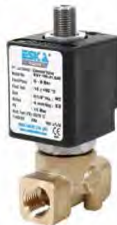
ESV 406 (3/2,N.C)

1: Inlet 2: Outlet (Body) 3: Outlet (Enclosing Tube) De-energised: 1-3 Energised: 1-2